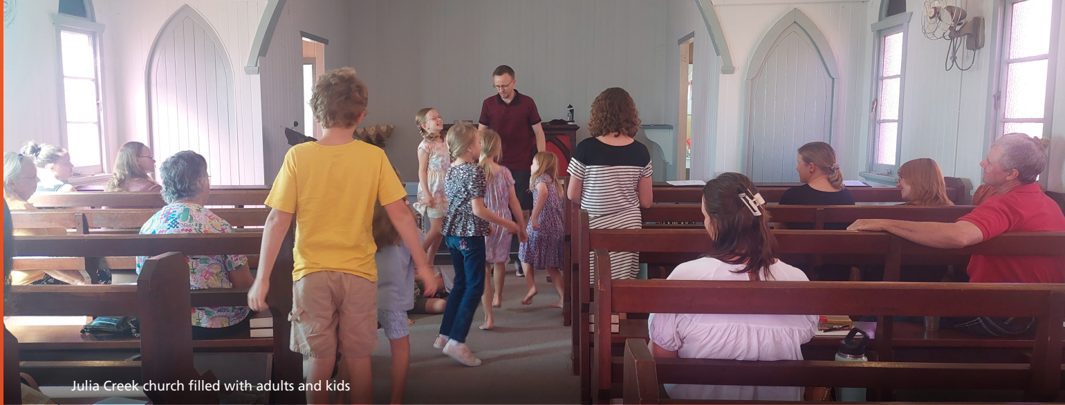
Julia Creek church filled with adults and kids